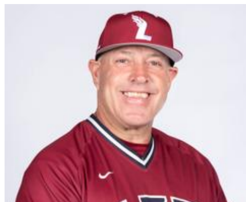
HEAD COACH | 19 TH SEASON @ LEE

Defeated Tusculum University 10-5 on April 10, 2024, to record his 700 th coaching victory.