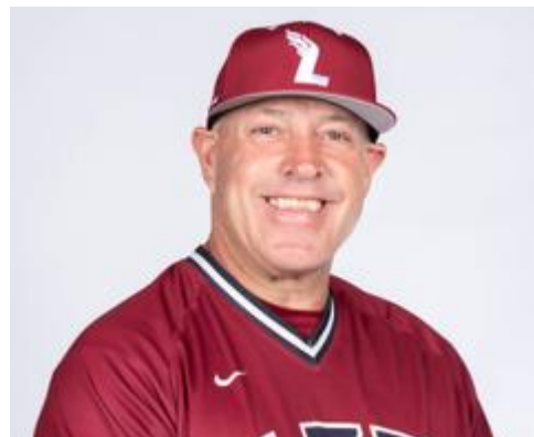
HEAD COACH | 19 TH SEASON @ LEE

Defeated Tusculum University 10-5 on April 10, 2024, to record his 700 th coaching victory.