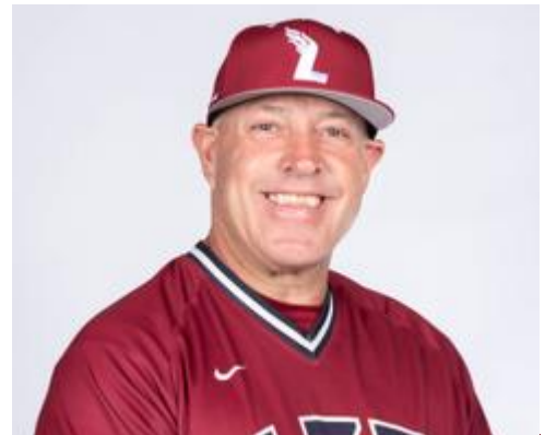
HEAD COACH | 19 TH SEASON @ LEE

Defeated Tusculum University 10-5 on April 10, 2024, to record his 700 th coaching victory.